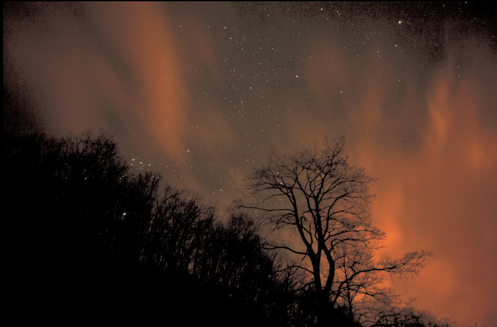
Stars in Tennessee