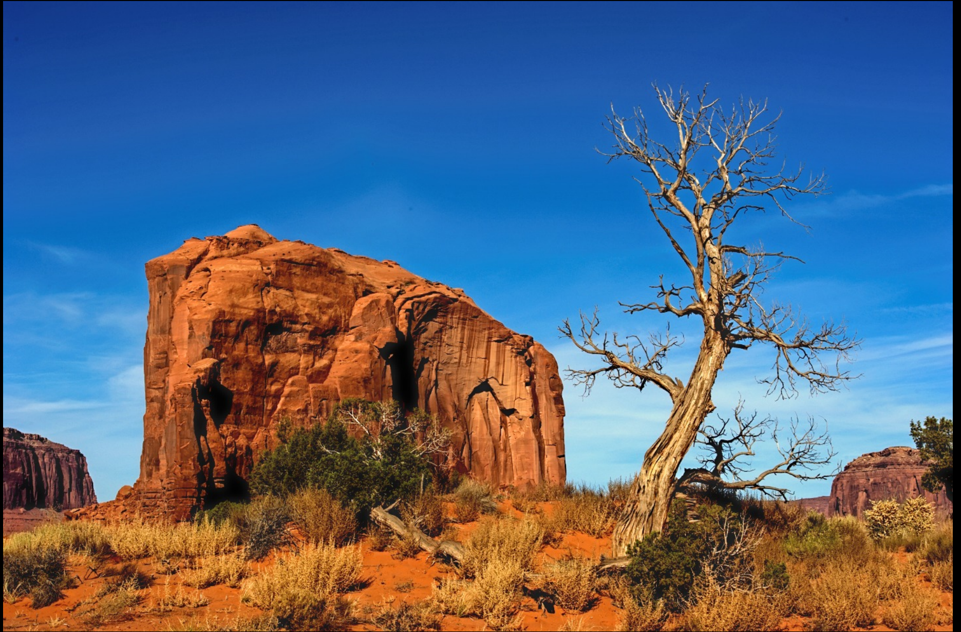
Monument Valley, Arizona