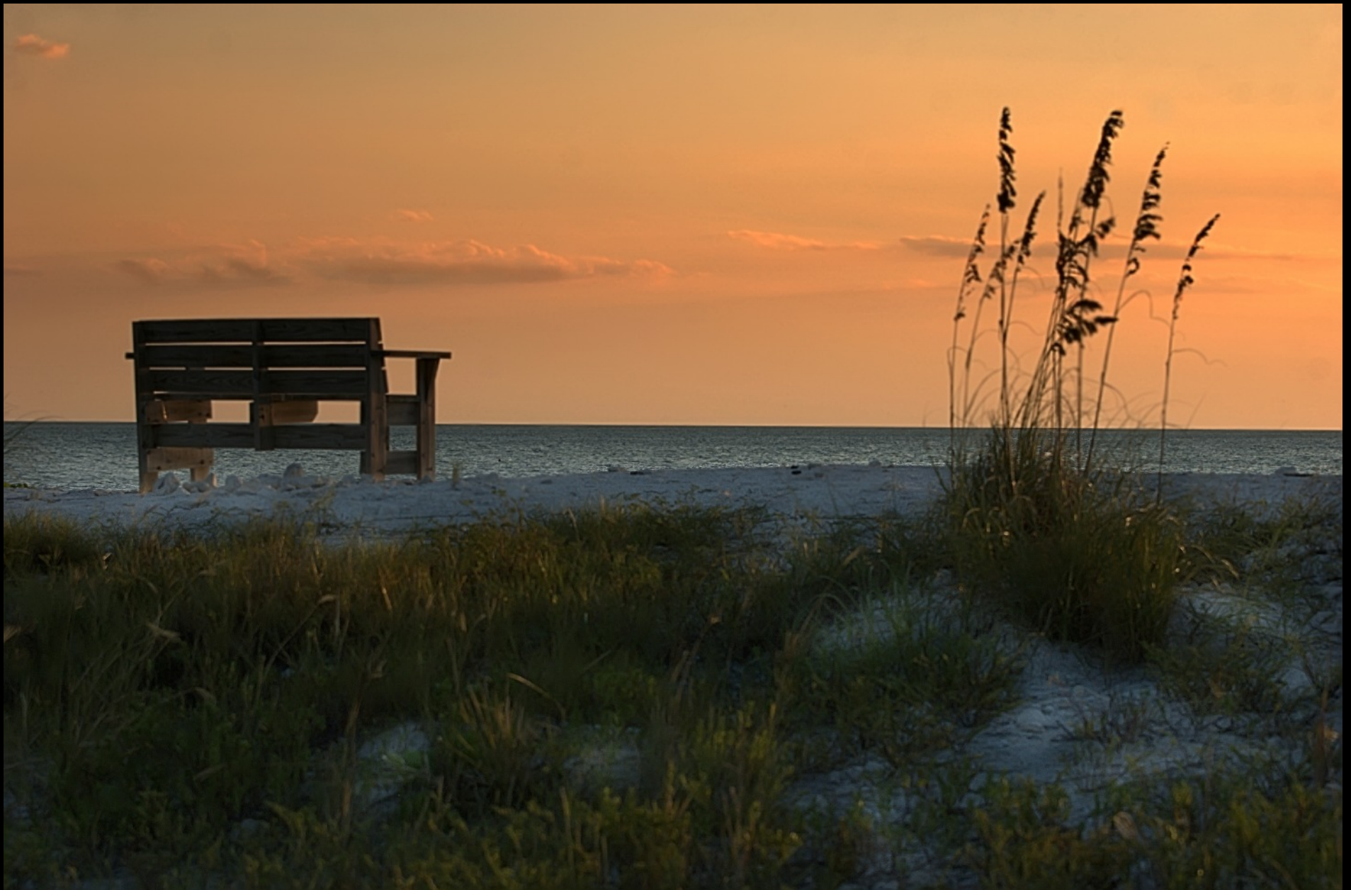
Someone used to sit here. Honeymoon Island State Park, Dunedin, Florida