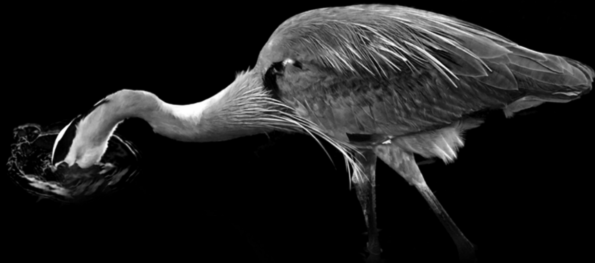
Great Blue Heron Black and White, Florida, USA