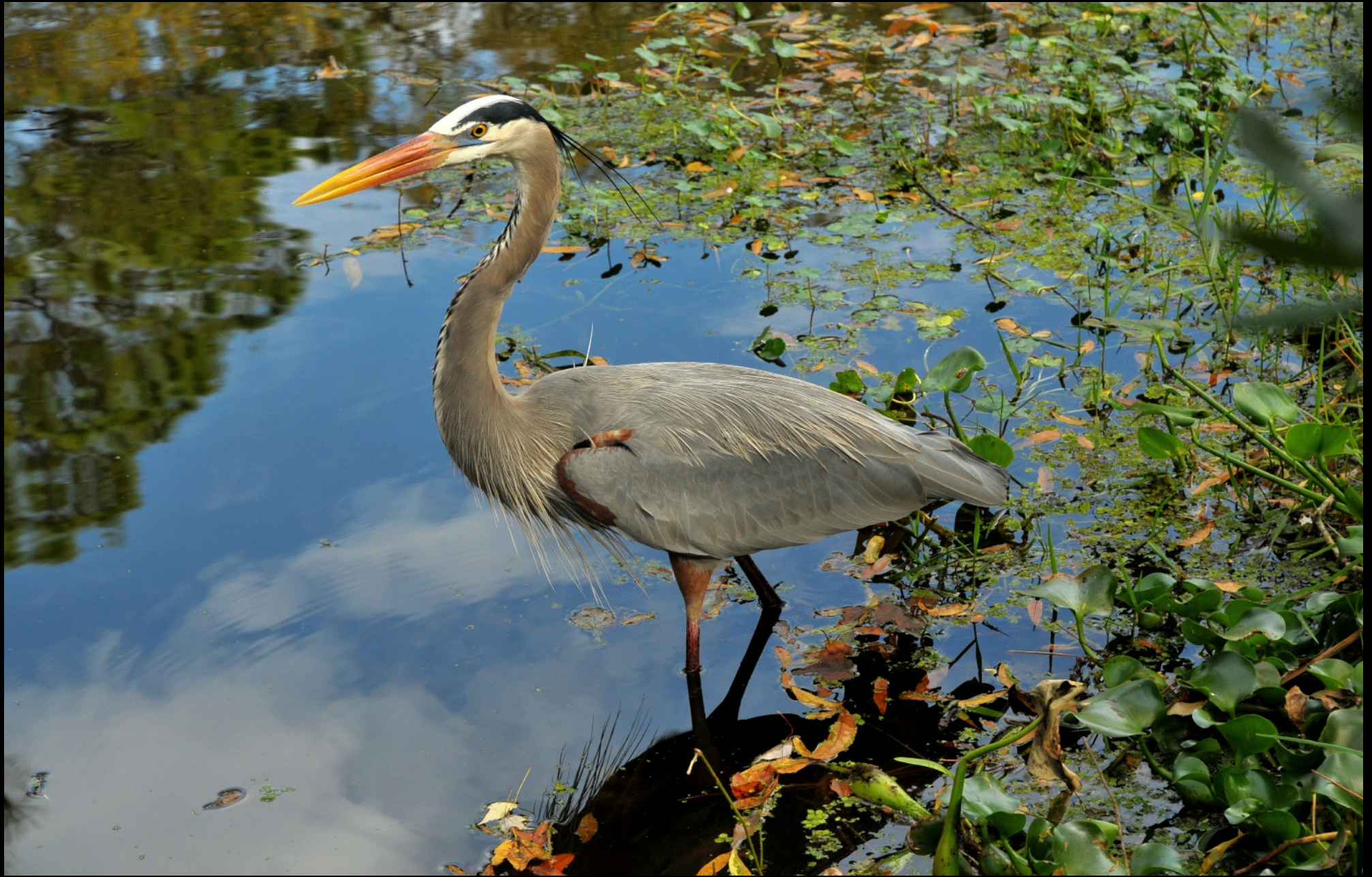
Great Blue Heron hunting.